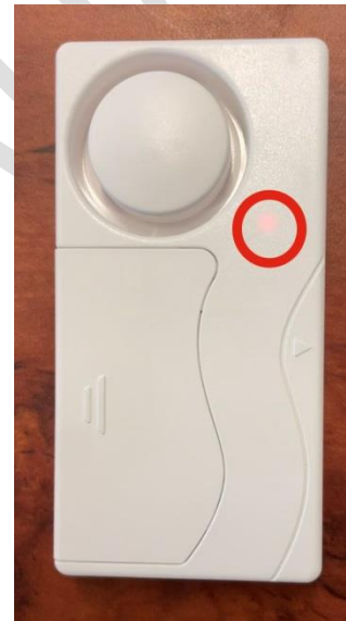
*A red light will appear when remote is being used with an alarm.